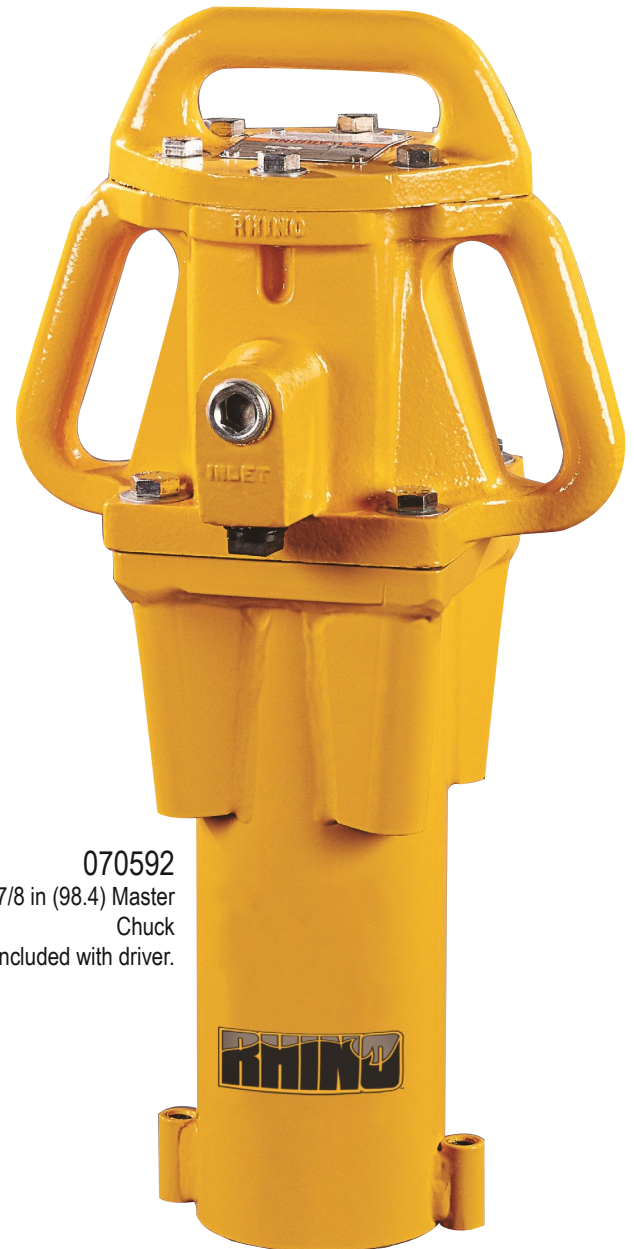
070592 3 7/8 in (98.4) Master Chuck included with driver.

■An optional master chuck is required ●An adapter is required ♦A driving cap is required ❖Indicates a combination of accessories is required