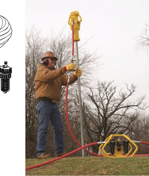
PD-55 shown with FRL and Carrier.